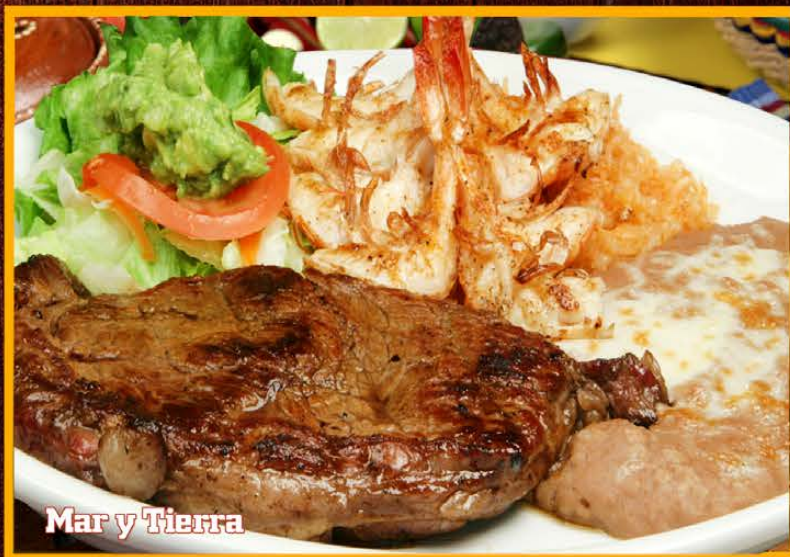
Mary y Tierra

2 pechugas de pollo con arroz, frijoles y ensalada. $16.99