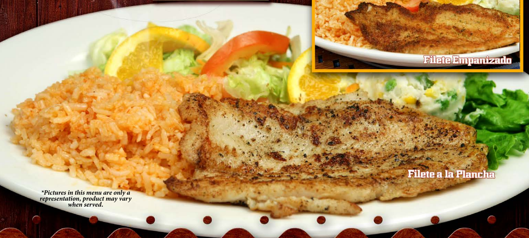
Filete a la Plancha

*Pictures in this menu are only a representation, product may vary when served.