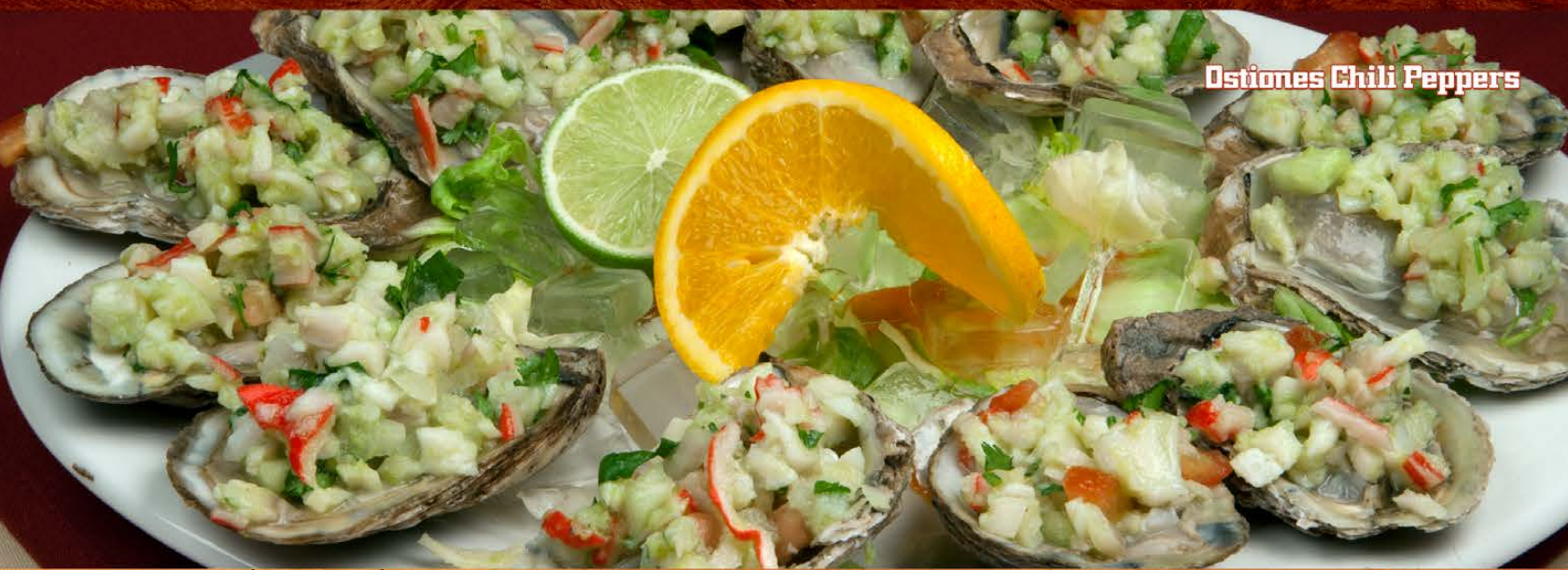
Ostiones Chili Peppers

*Pictures in this menu are only a representation, product may vary when served.