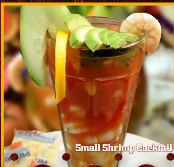
Small Shrimp Cocktail