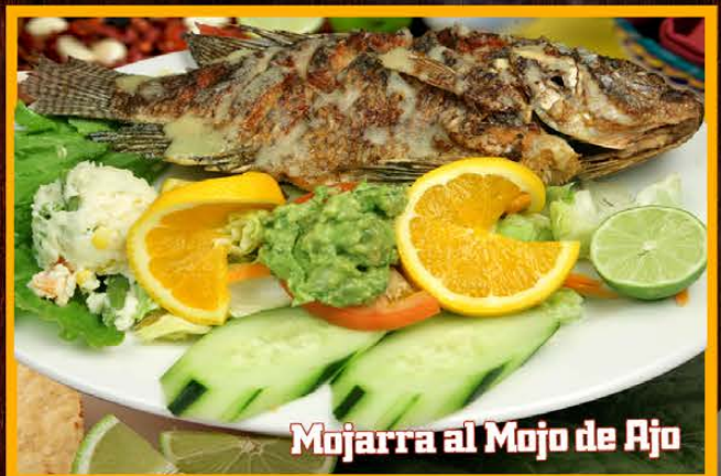
Mojarra al Mojo de Ajo