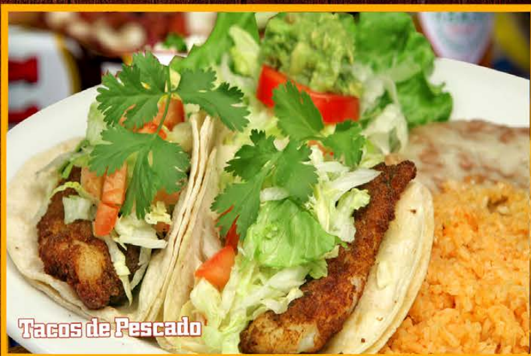
Tacos de Pescado