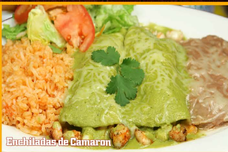
Enchiladas de Camaron