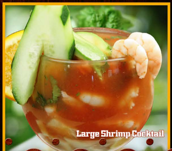
Large Shrimp Cocktail