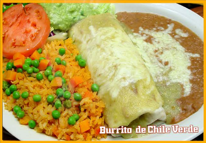
Burrito de Chile Verde