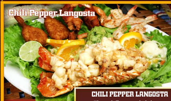
Chili Pepper Langosta

(Served with rice & beans) CHILI PEPPER LANGOSTA 1/2 lobster & three shrimp any style. $36.99